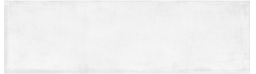
BREEZE IVORY 73BRZ-IVR-1240 Size: 11.7x39.2"