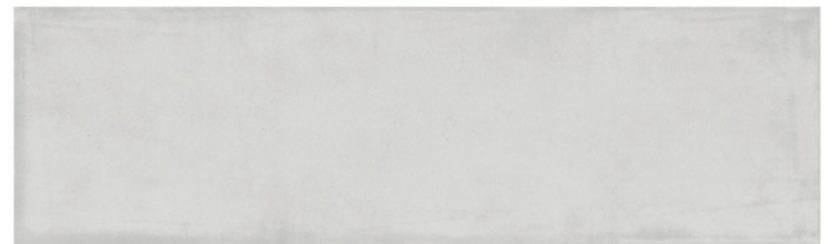
BREEZE GREY 73BRZ-GR-1240 Size: 11.7x39.2"