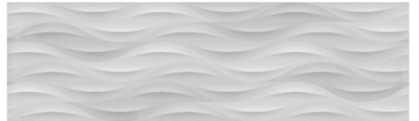
BREEZE IVORY DECO 73BRZ-IVR-DEC Size: 11.7x39.2"