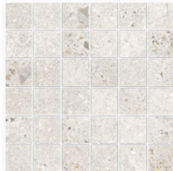
2x2 Mosaic (natural)