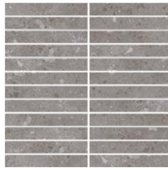
Stripe Mosaic (natural)