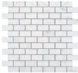
Brick Wall Mosaic