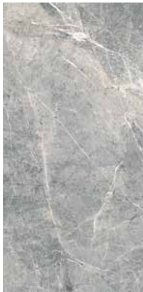
04EPIIMP1224 (matte) 04EPIIMP1224 (polished)