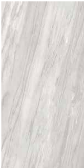
04EPIALA1224 (matte) 04EPIALA1224 (polished)