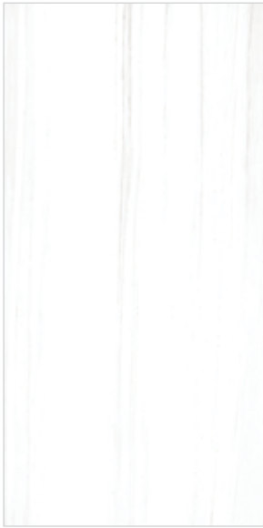
04EPIDOL1224 (matte) 04EPIDOL1224 (polished)