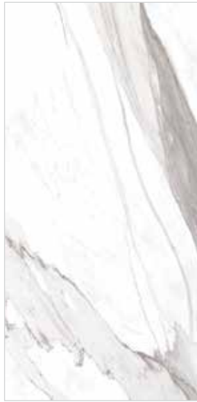
04EPIAPU1224 (matte) 04EPIAPU1224 (polished)