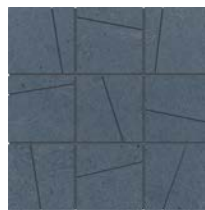
4x4 Random Angle Mosaic