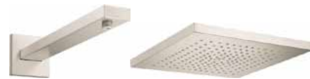
Raindance E - Brushed Nickel Showerarm, 15" Showerhead 300 / 1 Jet / 2.0 GPM