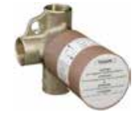
Trio 2-Way Diverter, 3/4"