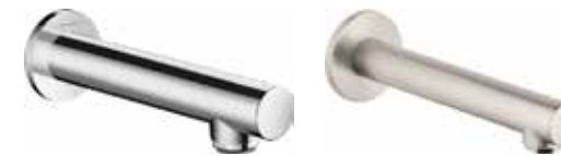
Talis S Wall Mounted Tub Spout