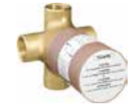
Quattro 3-Way Diverter, 3/4"