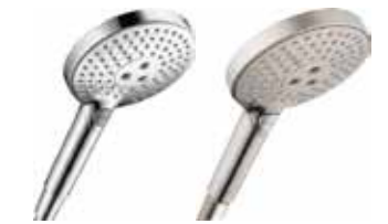
Raindance Select S Handshower 120 / 3 Jet P / 2.5 GPM

Select either a Porter or Wall Bar to accompany this product.