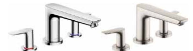
Talis E Roman Tub Faucet 3-Hole Rim Mounted / Ceramic Cartridge