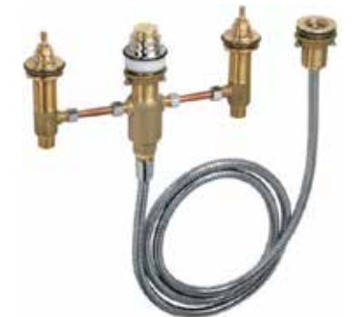
4-Hole Roman Tub Set