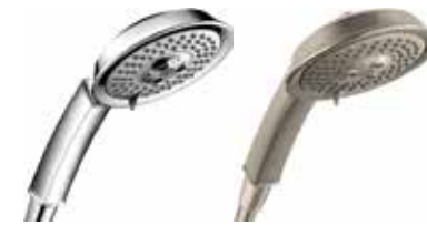
Raindance Classic Handshower 100 / 3 Jet / 2.5 GPM