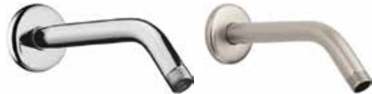
Standard Showerarm, 9"

Select either a Porter or Wall Bar to accompany this product.