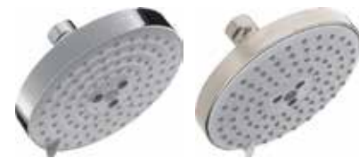
Raindance S Showerhead 150 / 3 Jet / 2.5 GPM