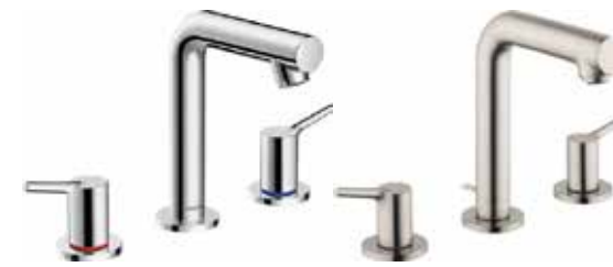
Talis S Widespread Lavatory Faucet Pop-Up Drain / 1.2 GPM