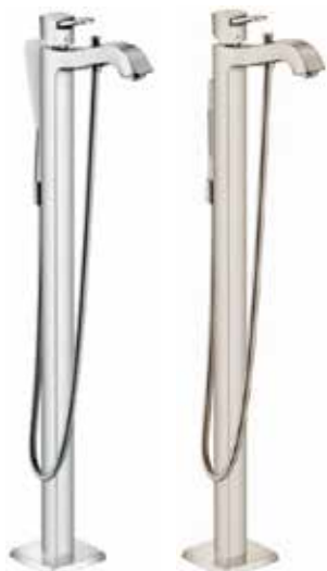
Metropol Classic Floor Mount Tub Filler