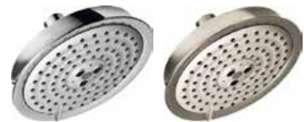
Raindance Classic Showerhead 150 / 3 Jet / 2.5 GPM