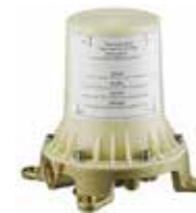
Freestanding Tub Filler