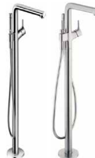
Talis S Floor Mount Tub Filler