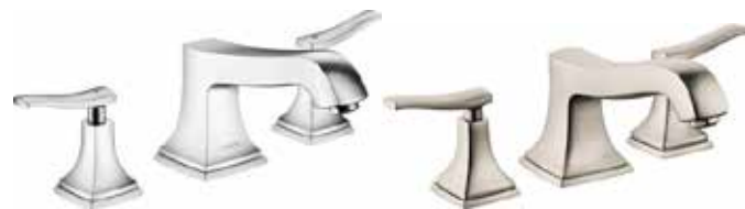
Metropol Classic Roman Tub Faucet Lever Handles / 3-Hole Rim Mounted / Ceramic Cartridge