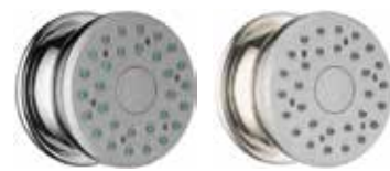
Bodyvette Body Shower 1 Jet with Stop