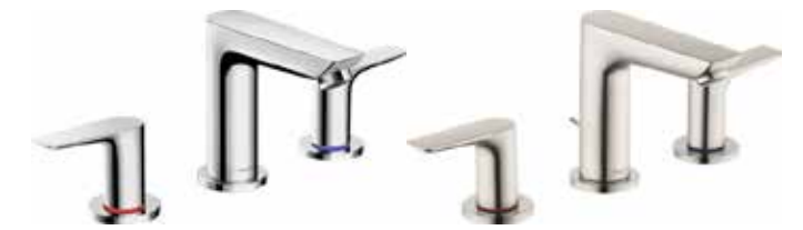
Talis E Widespread Lavatory Faucet Lever Handles / Pop-Up Drain / 1.2 GPM