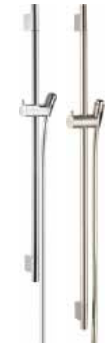
Unica Wallbar S, 24"

Hose included. Fixfit and Handshower sold separately.