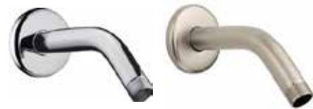
Standard Showerarm, 6"