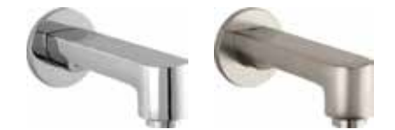
Metris S Wall Mounted Tub Spout