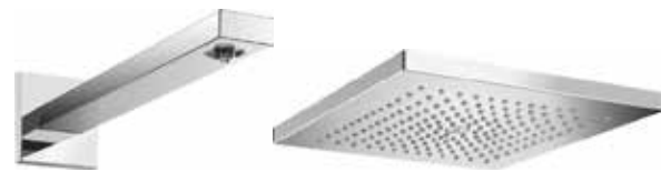
Raindance E - Chrome Showerarm, 15" Showerhead 300 / 1 Jet / 2.0 GPM