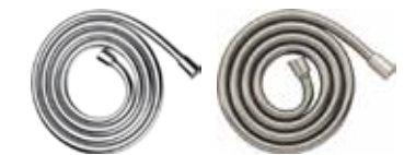
Shower Hose Techniflex, 63"

Handshower, Hose, and FixFit sold separately.