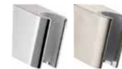
Porter S for Handshower