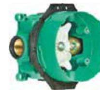
iBox Universal Plus with Service Stops, 3/4"