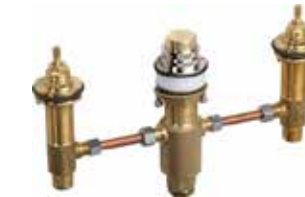
3-Hole Roman Tub Set