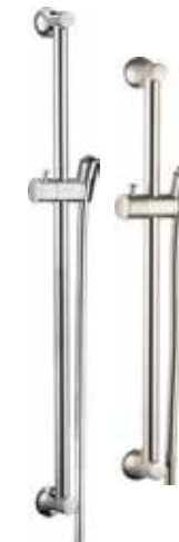
Unica Wallbar Classic, 24"