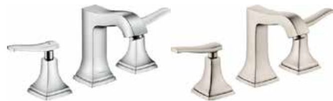
Metropol Classic Widespread Lavatory Faucet Lever Handles / Pop-Up Drain / 1.2 GPM