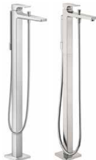
Metropol Floor Mount Tub Filler