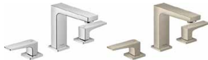
Metropol Widespread Lavatory Faucet Lever Handles / Pop-Up Drain / 1.2 GPM