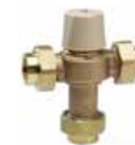
Hot Water Tempering Thermo Mixing Valve for Floor Mount Tub Fillers